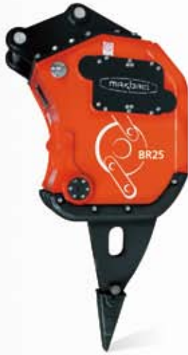
BR25 / BR25H