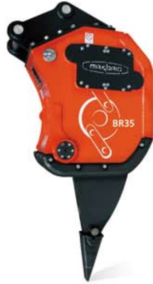
BR35 / BR35H