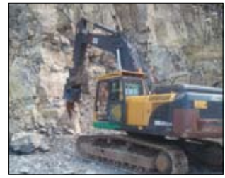
2005 CZECH REPUBLIC